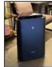
【Public space】 We provide air purifier and leave the entrance open for ventilation.