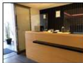
【Front Desk】 We installed the partition at front desk.