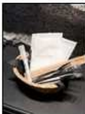
【Provision of supplies】 Although we have some kitchen supplies in all rooms, we provide disposable kitchen supplies as your requested.