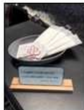
【Anti-Virus Hand Wipes】 We provide anti-virus hand wipes at front desk.