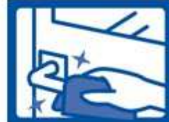
Disinfection all devices and facilities