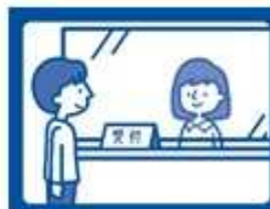
Installation of the partition at front desk