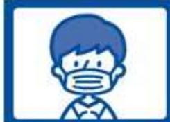
Recording of body temperature and wearing masks