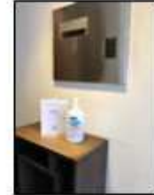
【Hand sanitizers】 We provide hand sanitizers at entrance, lobby and public restroom.