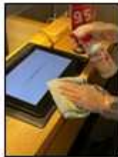
【Enhances disinfection】 We disinfect all devices and facilities such as doorknobs, door, elevator buttons and restroom.