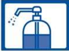
Provision of hand sanitizers